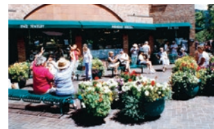
Paradise Bakery corner, 1996

For more than a decade, Paradise Bakery has sponsored the AHS Ice Cream Social, providing their beloved gelato for hundreds during the popular annual event at the Wheeler/Stallard Museum.